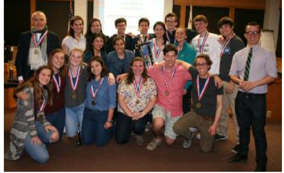
Miramonte's team won the Mock Trial competition.