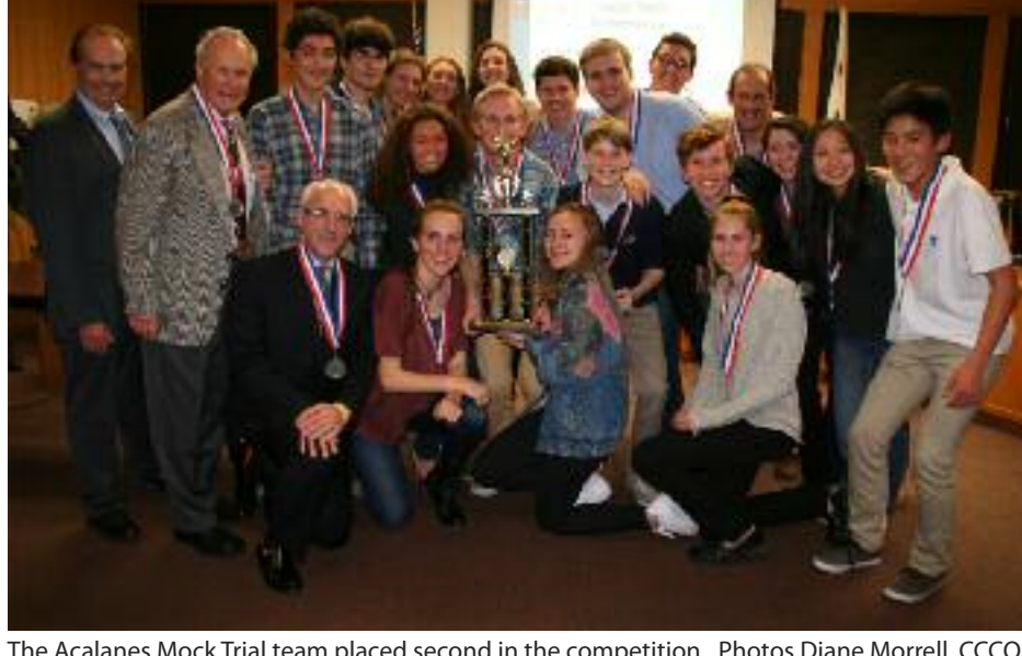
The Acalanes Mock Trial team placed second in the competition.

School team and 14 other Contra California High at fourth. Costa County high school Mock Trial teams have been battling it out with each other inside the superior courthouse courtrooms of Martinez. Miramonte will now represent Contra Costa County at the California State Mock Trial competition, held in Sacramento, March 18-20. California's state finalist team will then compete in the National Mock Trial Competition, held in Boise, Idaho,